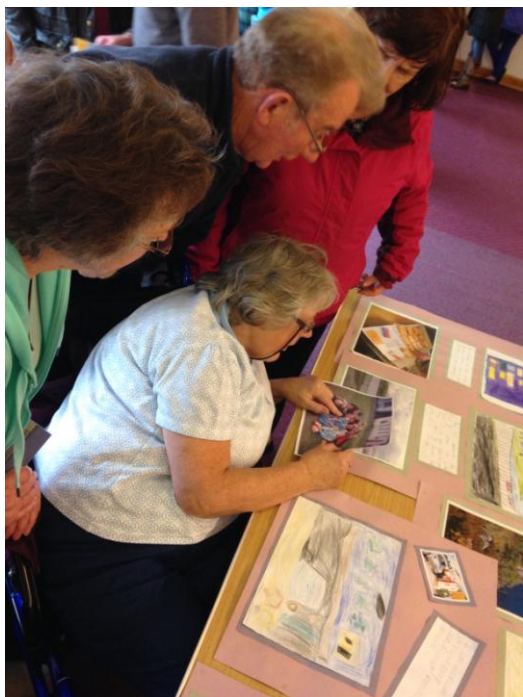
Old photographs and new artwork on show at the Travelling the Archive follow-up event in the community hall in September'