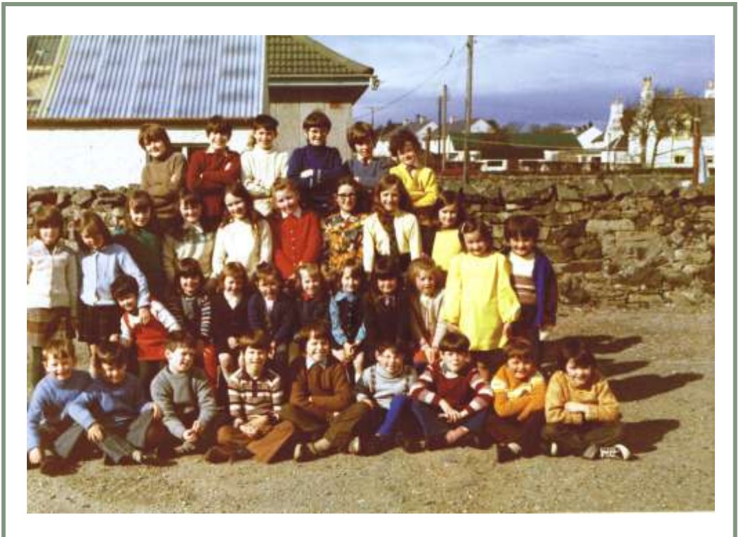
1973ish Kyleakin Old School

The majority of the houses in the village have undergone some form of extensions/ alterations, have you found anything unexpected that you think would be of interest to the Society?